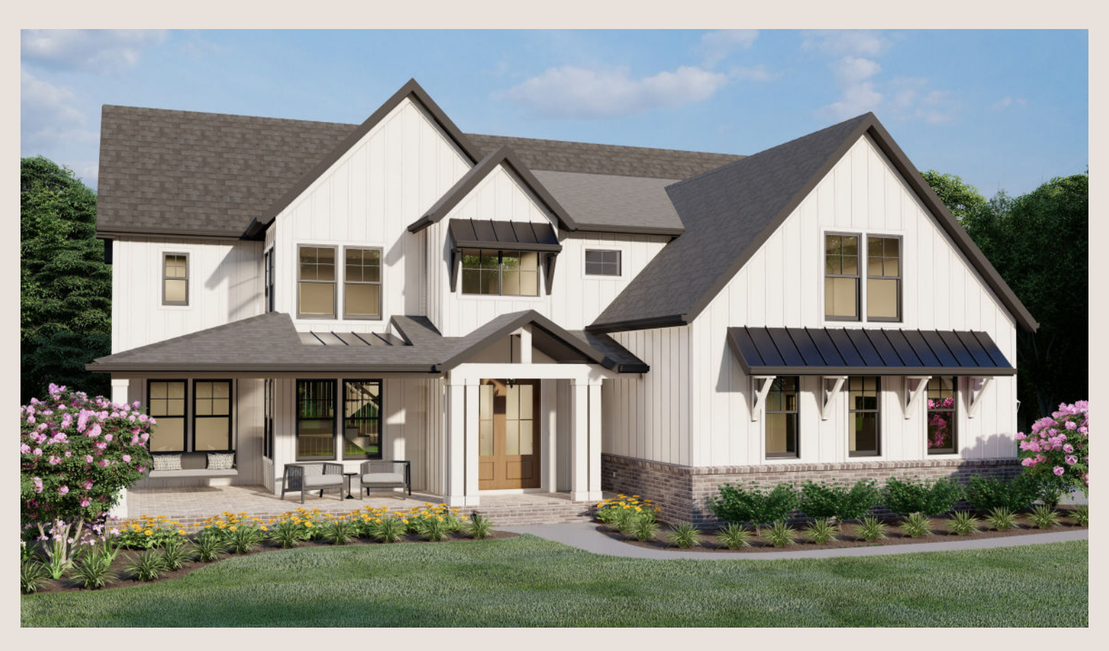
Elevation B - Craftsman