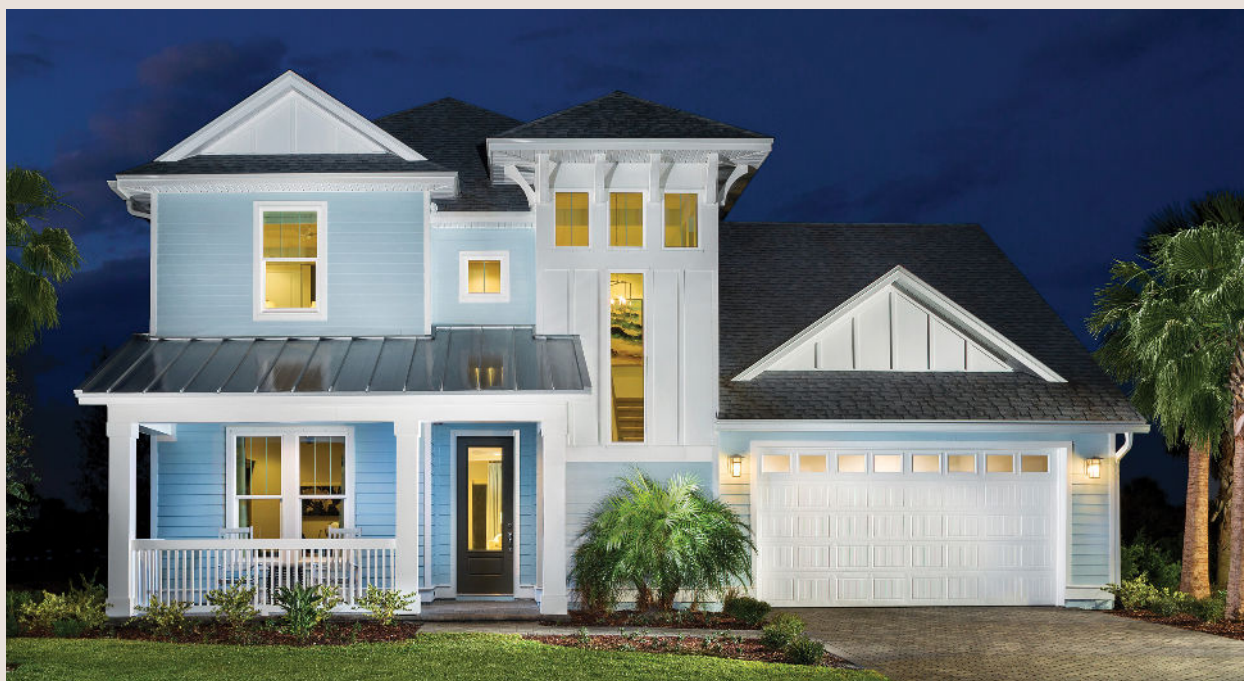
Elevation C – Coastal