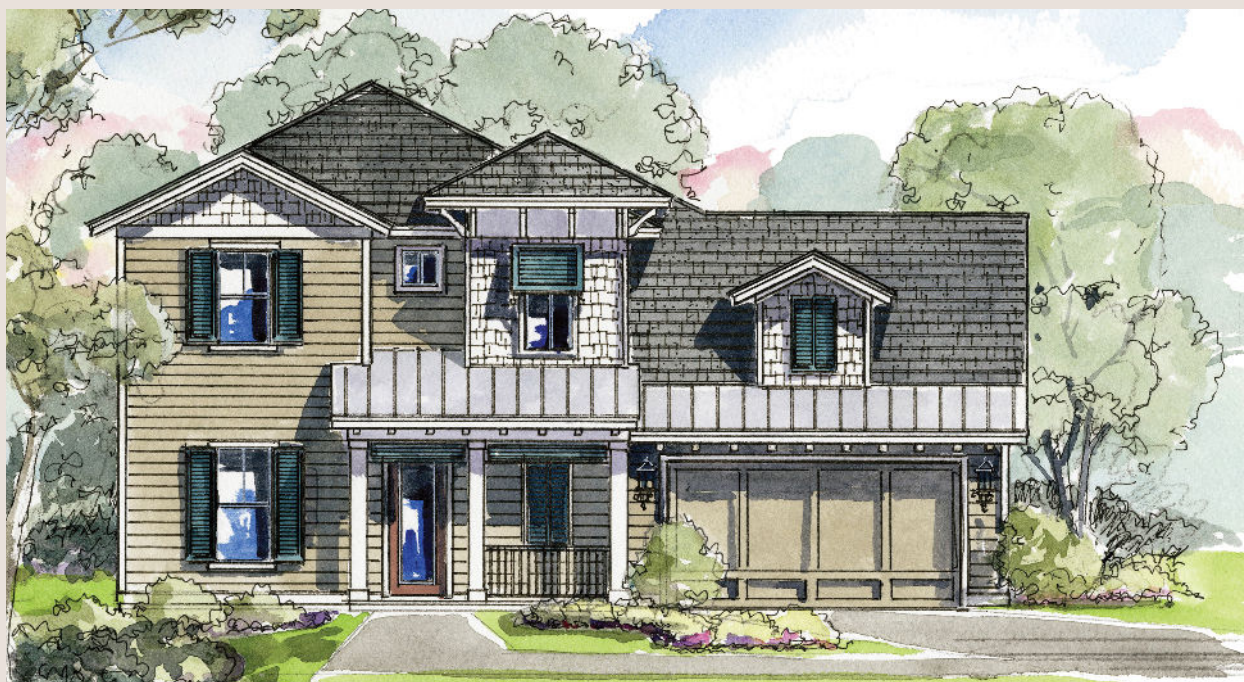
Elevation A – Coastal